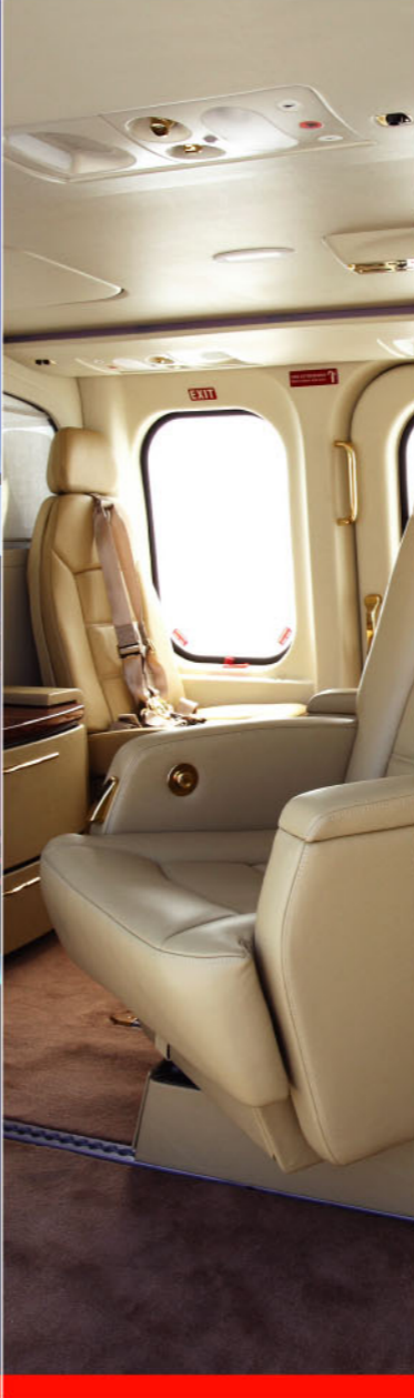
MORE ROOM TO WORK