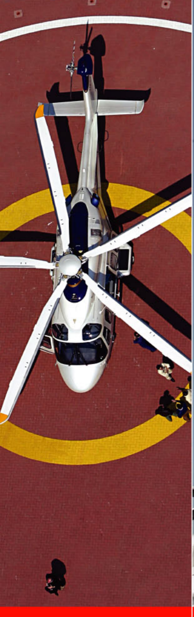
MORE THAN A NEW AIRCRAFT